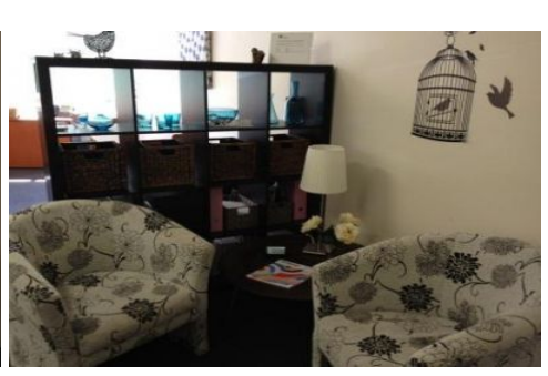
Suite 3/ 754 Old Princes Highway, Sutherland SUTHERLAND NSW

34m2 First floor office positioned opposite Sutherland Station.